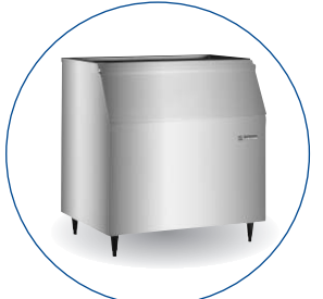
BIN: BH1300 BIN: BH900