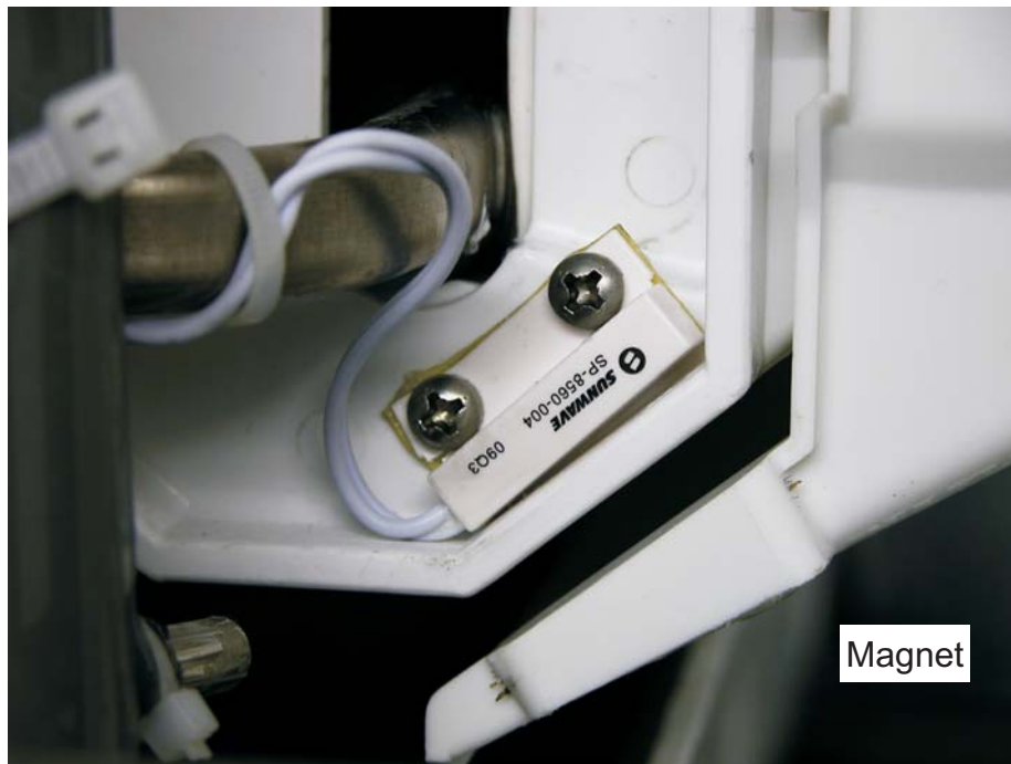
Curtain Switch in New Location