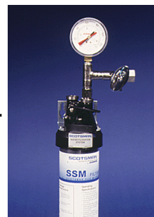
Water Filter Example