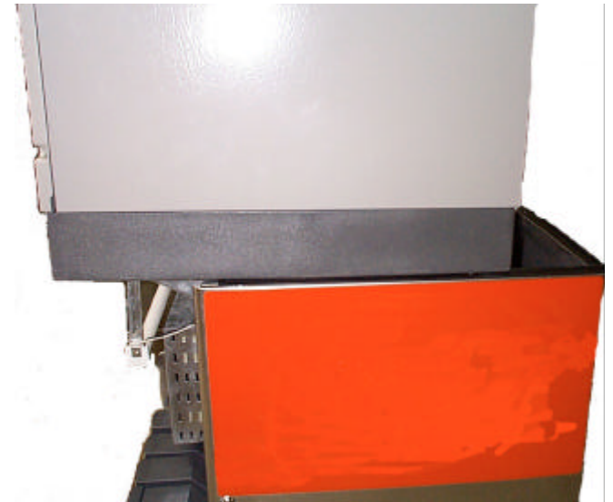
Ice Machine on Dispenser

5. Locate bin thermostat bulb. Remove cable tie and route bulb through base into dispenser hopper.