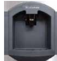
Easy Push Chute